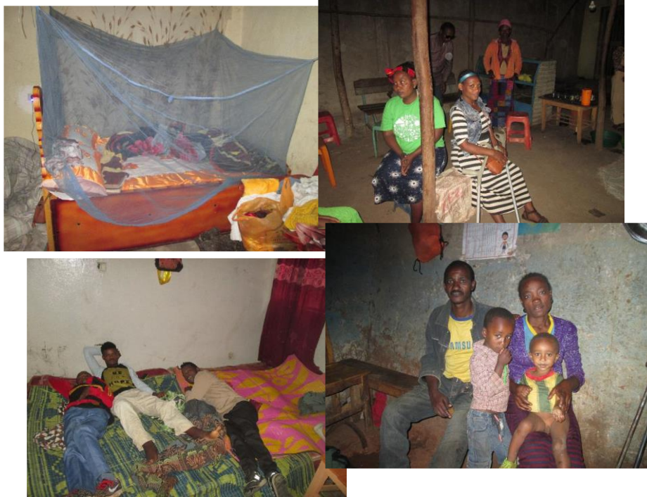
Photos above: Nighttime accommodations, people with their few worldly goods – Evening snack in the women's quarters (power failure!)