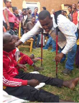
Village visits (outreach & assessment): needy disabled persons are registered for the support fund