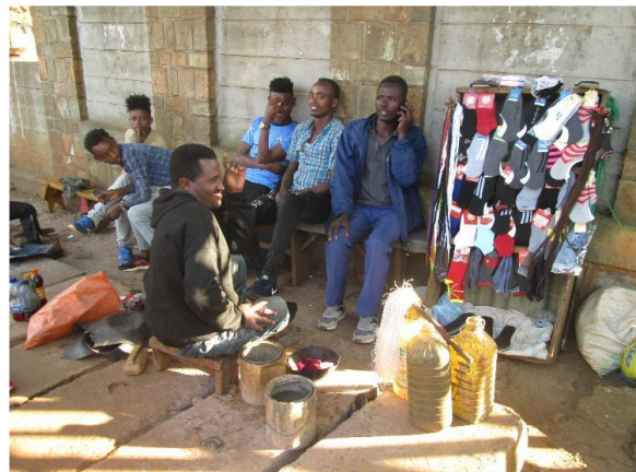
Meeting at the men's workshop and visiting the shoe shiners (Visit October 2019)

The Annual Report 2019 contains a summary of the events of the past year as well as an outlook on the activities of Project Emmanuel Ethiopia & Verein Emmanuel Schweiz for this year. Further information: see our website ( www.Project-emmanuel.ch ) & our newsletters. The 2019 financial report will be issued in the spring of 2020.