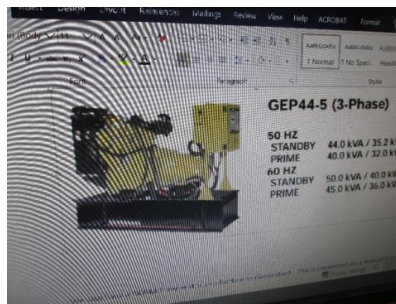
Offer for the 2 nd generator