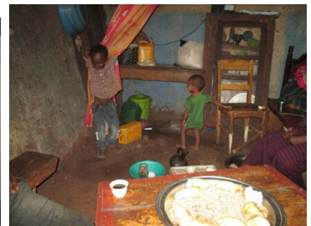
Future family house?