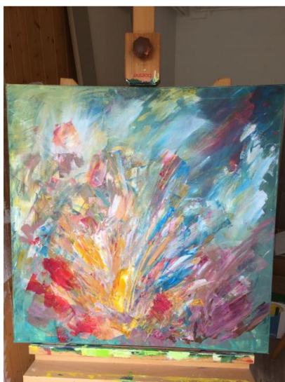
GIVING HOPE – THE VISION & GOAL OF EMMANUEL